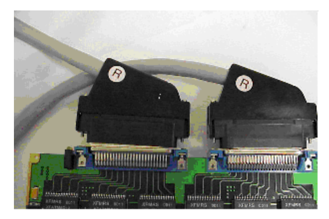
Figure D-1 Cable Attached to the ZXRTB24R

The diagrams below illustrate the cables when they are properly attached.